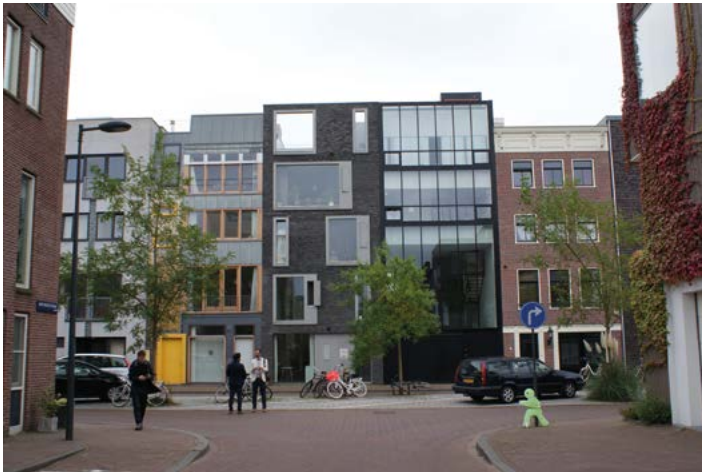
A diverse housing supply: Custom Build homes in the Netherlands

Custom & Self Build housing is rapidly growing in importance in the UK. Its development helps to speed up housing delivery locally and adds to the diversity of new housing. Local planners now have a responsibility to plan positively for this type of housing.