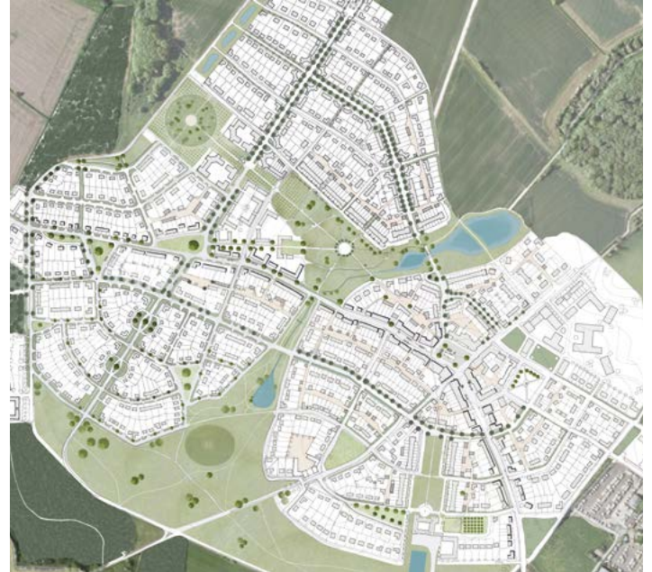
Tresham Garden Village Masterplan by Charlton Brown Architects - local plans and new settlements can ensure the provision of Custom & Self Build plots